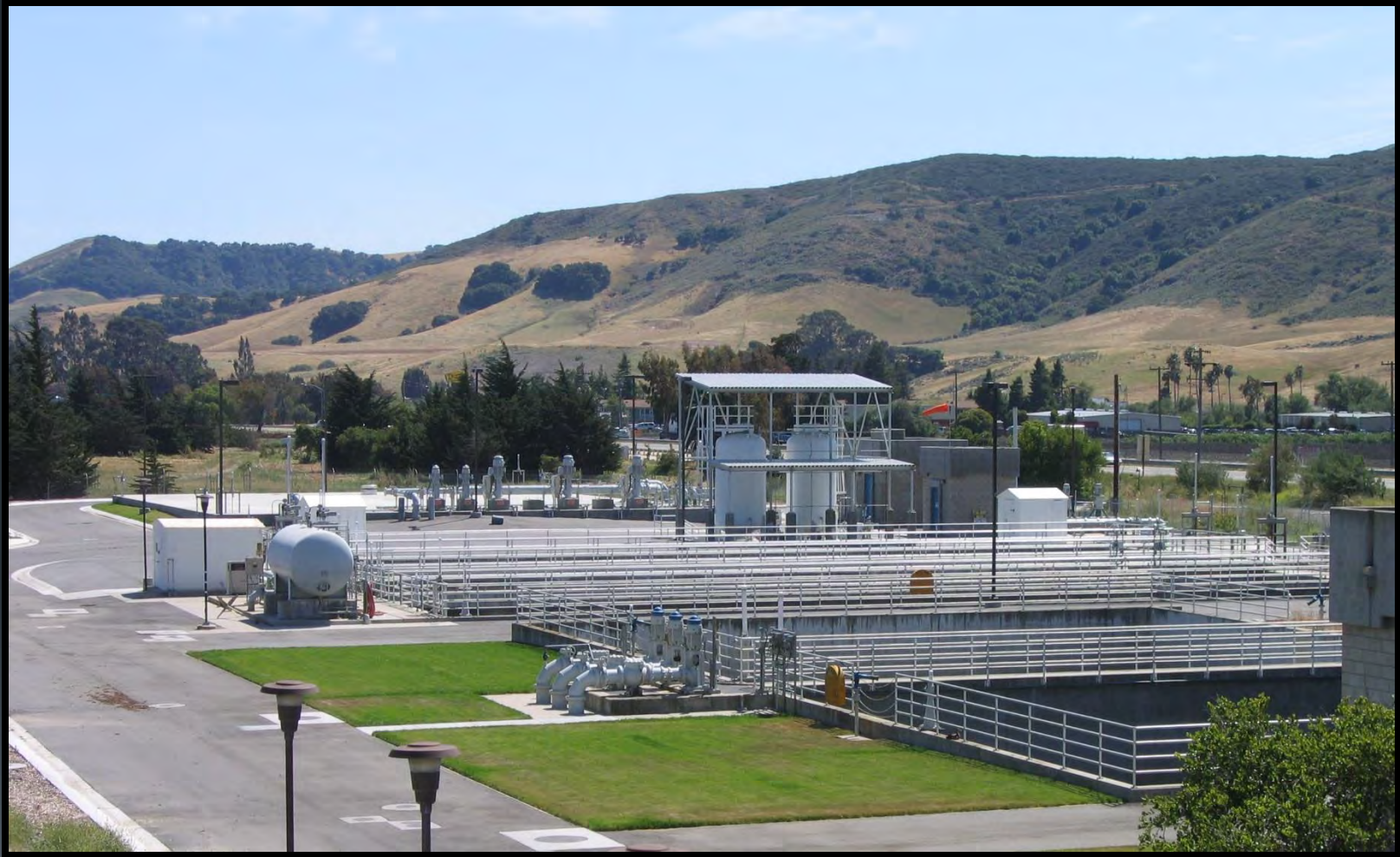
Recycled Water Distribution Center